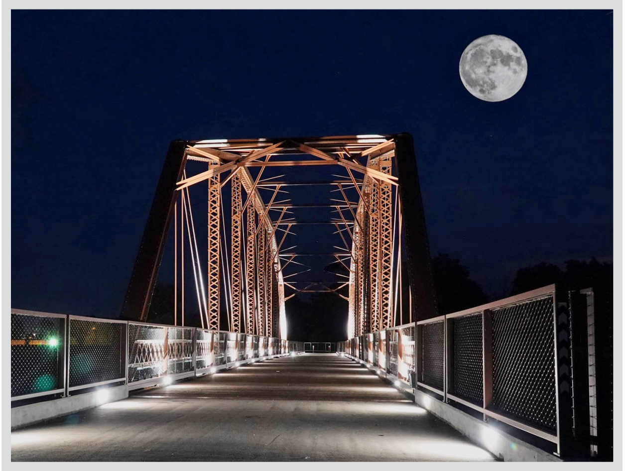
Kitselman Gateway Bridge Project