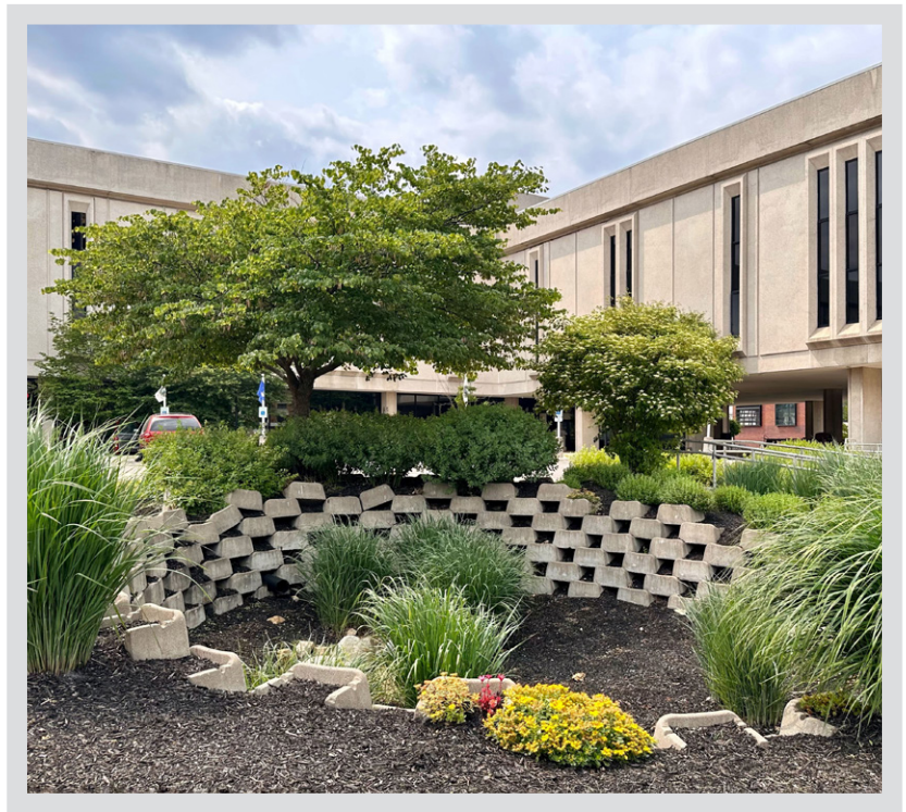
Delaware County Building Project